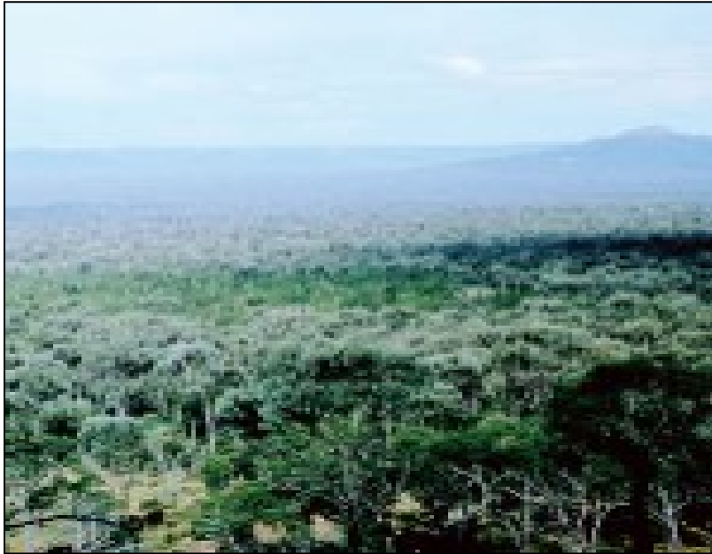
Brigalow ecosystems stretching across the Arcadia Valley in the 1960s: Brigalow Belt South. It is now cleared and many ecosystems are now threatened. (R.W. Johnson)

The Brigalow Belt Bioregion (North & South) has been declared a biodiversity hotspot and yet vegetation clearing for agriculture and mining is still rife in the bioregion. The Australian Biodiversity Assessment 2002 is clear that comprehensive action is needed now to protect and maintain our ecosystems and ecological communities rather than allow the repair task to get out of hand.